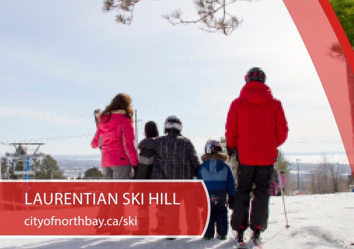
LAURENTIAN SKI HILL cityofnorthbay.ca/ski