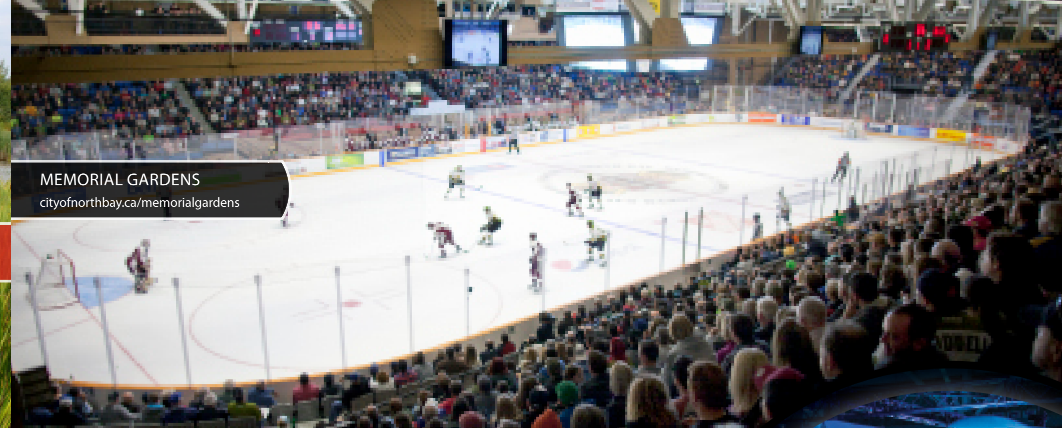
MEMORIAL GARDENS cityofnorthbay.ca/memorialgardens