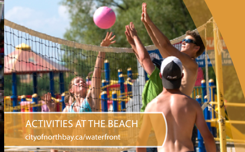
ACTIVITIES AT THE BEACH cityofnorthbay.ca/waterfront