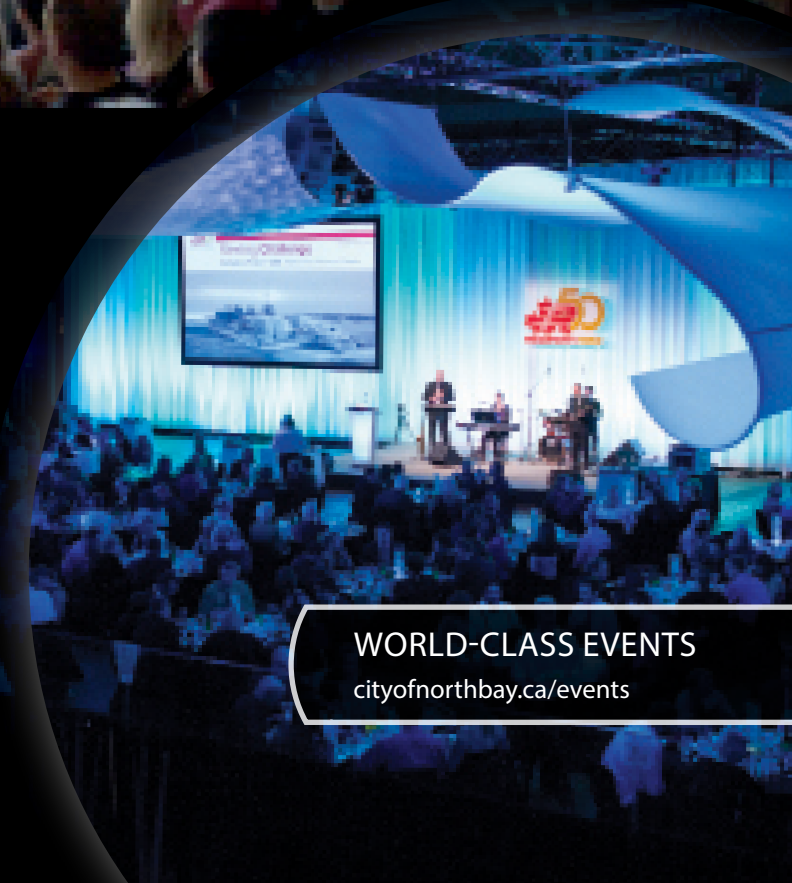
WORLD-CLASS EVENTS cityofnorthbay.ca/events

The City of North Bay is home to future NHL stars! Come out and support our OHL team the North Bay Battalion... Go Troops Go! battalionhockey.com