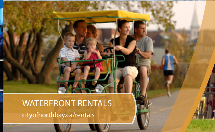
WATERFRONT RENTALS cityofnorthbay.ca/rentals