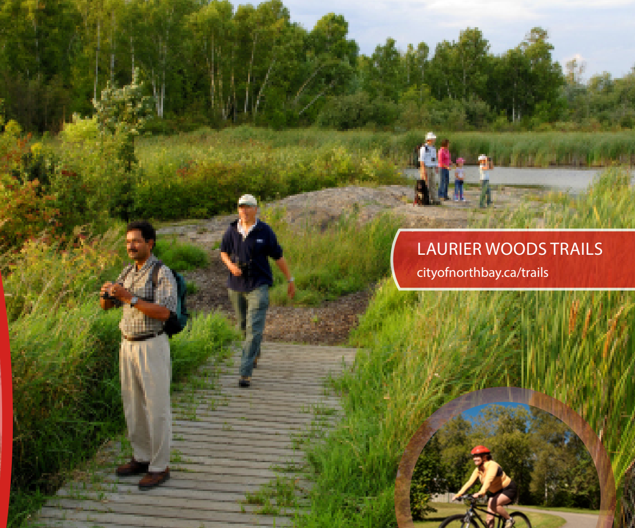
LAURIER WOODS TRAILS cityofnorthbay.ca/trails