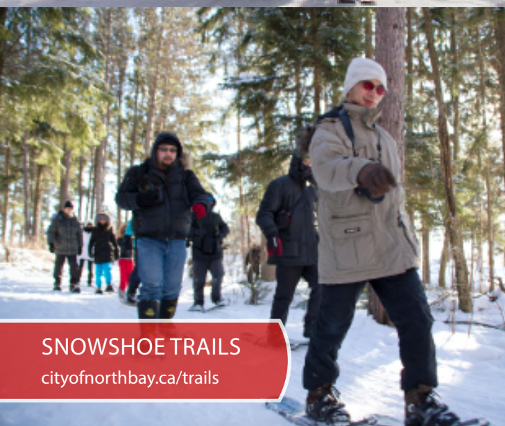
SNOWSHOE TRAILS cityofnorthbay.ca/trails