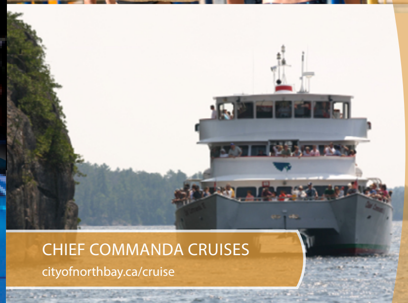
CHIEF COMMANDA CRUISES cityofnorthbay.ca/cruise