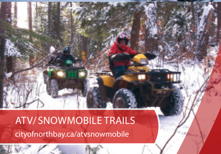
ATV/ SNOWMOBILE TRAILS cityofnorthbay.ca/atvsnowmobile

During the summer, walk, run, bike or rollerblade the Kate Pace Way located alongside North Bay's scenic Waterfront Park and take in a gorgeous sunset overlooking Lake Nipissing. Hundreds of kilometres of multi-use trails are also available for those who seek a more challenging terrain.